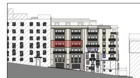
St. Ursula street façade