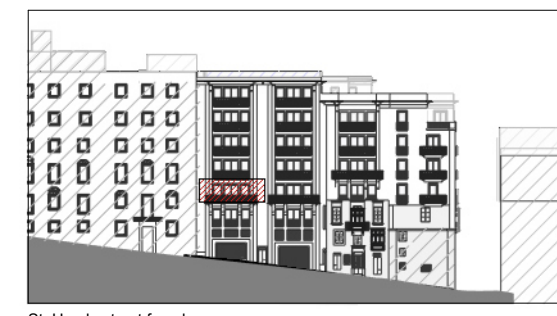
St. Ursula street façade