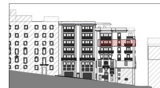
St. Ursula street façade