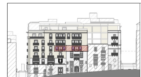
Melita street façade